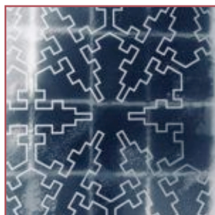
Satellite sandwich with fractal antenna metamaterial over solar cells.

As part of the IEEE History Center’s mission to promote the history of IEEE’s fields of interest, staff write articles and give presentations throughout the year. Here are some of the highlights of their outreach.